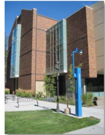
Blue Light Emergency Station