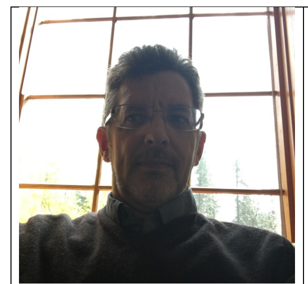
1: Backlit – (bad) in front of a window turns you into a silhouette. You're nearly invisible!

Here are some examples of how lighting can make or break your video.