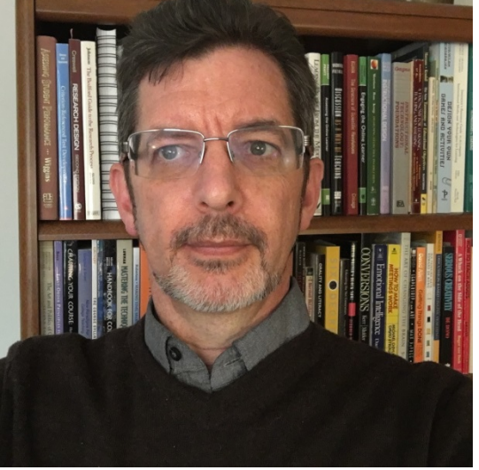
5: Indoor – (good) Combination of indoor and natural lighting. Background isn't distracting.