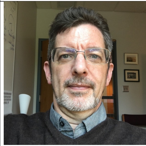
6: Natural – (good) Seated facing window for natural lighting. Camera level with face.