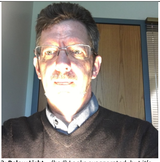
3: Below Light – (bad) Looks exaggerated, but it's still creepy. Too much light, too.