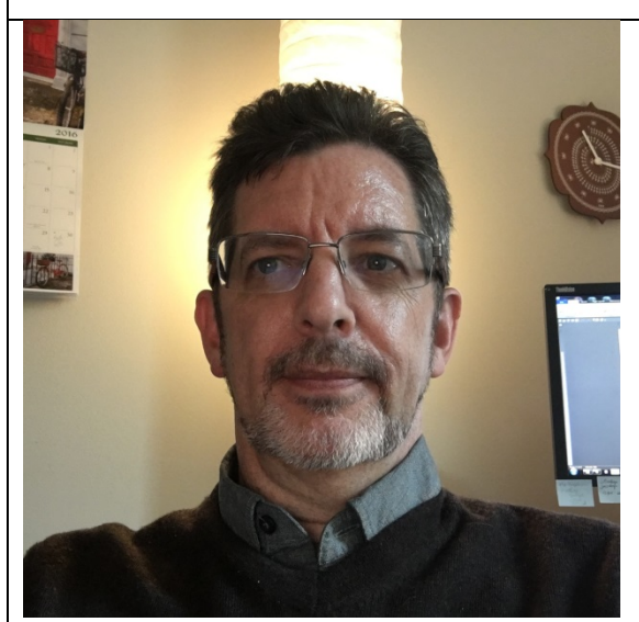
4: Head Protrusion – (bad) I have a lamp projecting out of my head. Distracting, no?