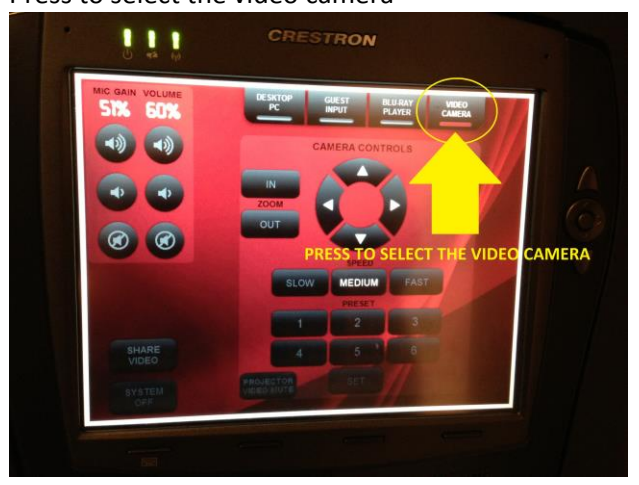
The Video Camera Controls