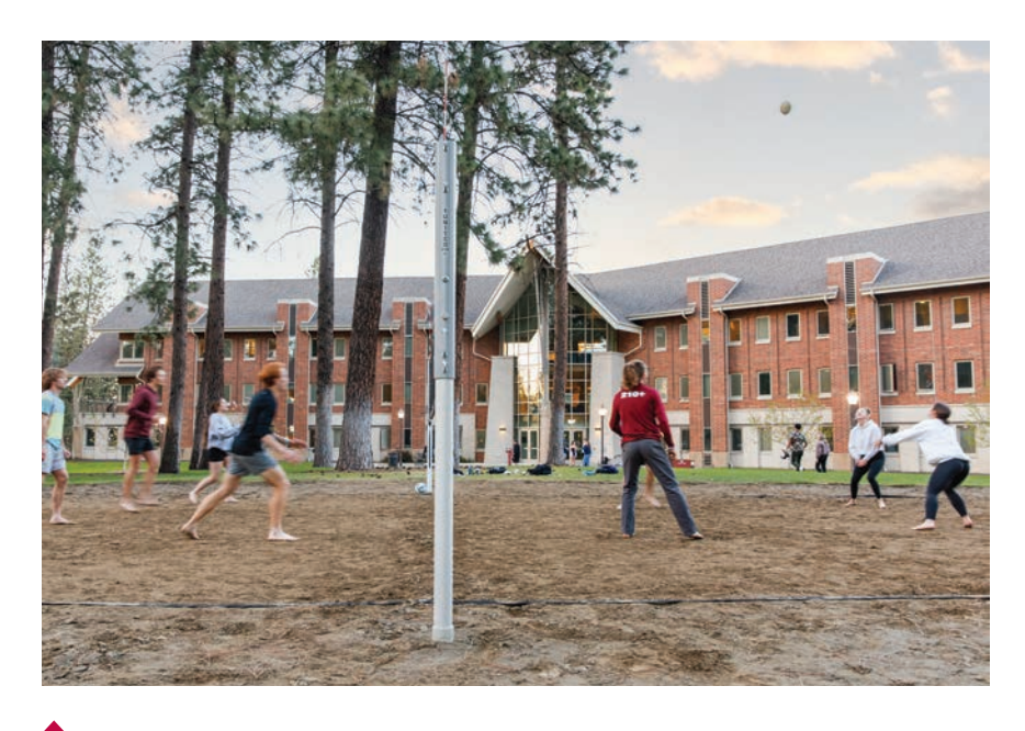
OLIVER HALL Large common areas make it easy to build community. Comfortable, supportive.

McMILLAN HALL ______ Men's hall with a rich history and modern amenities. Active, deep roots.